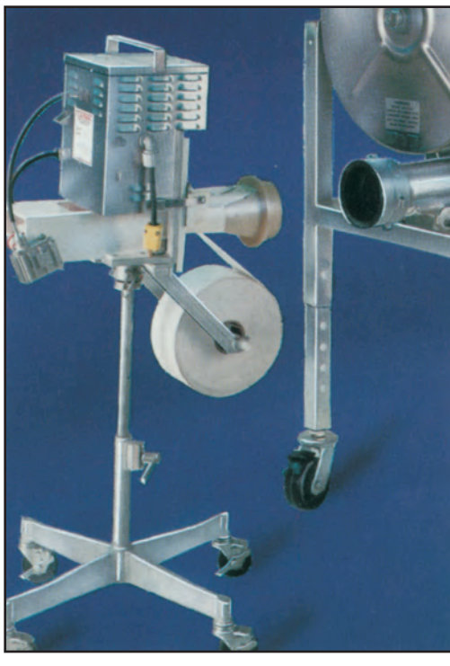
No tools required for disassembly. Unclamp from the grinder and roll your bulker to the sink (or store it) on its convenient mobile stand. Large paper roll means less down time.