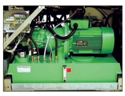
At the Heart of the PortionPro 320 is the 20 H.P. all Hydraulic drive system. This system which is micro processor controlled gives the operator precise adjustment capability over all of the basic machine functions.