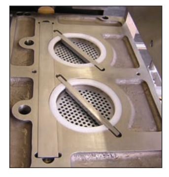
The Exclusive 2 – Hole Roto-Flow Fill System provides a gourmet patty that is second to none. The Roto Flow fill system forms meat columns that are gently twisted together providing a patty that is more tender, cooks faster, and retains its shape better than standard patties.