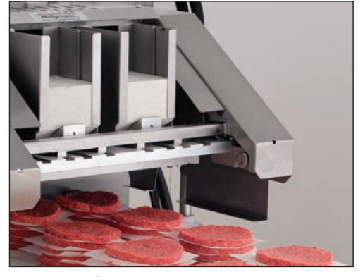
The patented Side Notch paper feeding system assures consistently interleaved patty stackes. The unique design allows the entire 2 – hole Paper feed assembly to be changed for a different size in minutes.

1. The spiral arm in the hopper gently move the product to the rotor. 2. The mold plate moves under the rotor. The program controlled rotor starts fast and fills the mold plate with product until the fill pressure for that product is reached. Back flow is eliminated. 3. The mold plate is pushed forward and the portions are knocked out of the mold plate. Patented side notch paper feed system automatically interleaves paper between each portion.