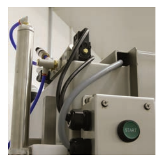
Pneumatic Auto Blade Guard.