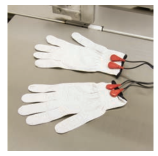
Color detection Gloves.