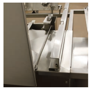
Water Spray pre-attached blade cleaning system.