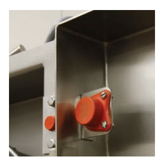
Coded safety interlocking sensors.