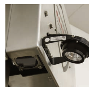
Visual Glove detection system (patent pending).