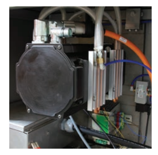
No maintenance direct drive train, zero backlash.