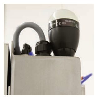
LED 3-color Indicator light.