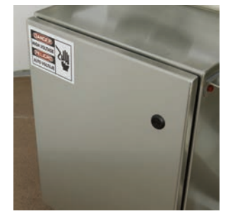
IP69 Electrical Enclosures.