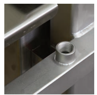
Frame clean-out flushing port.