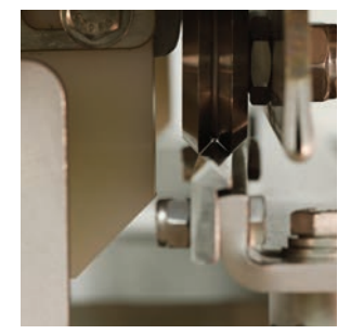
V-groove roller bearing, moveable table.